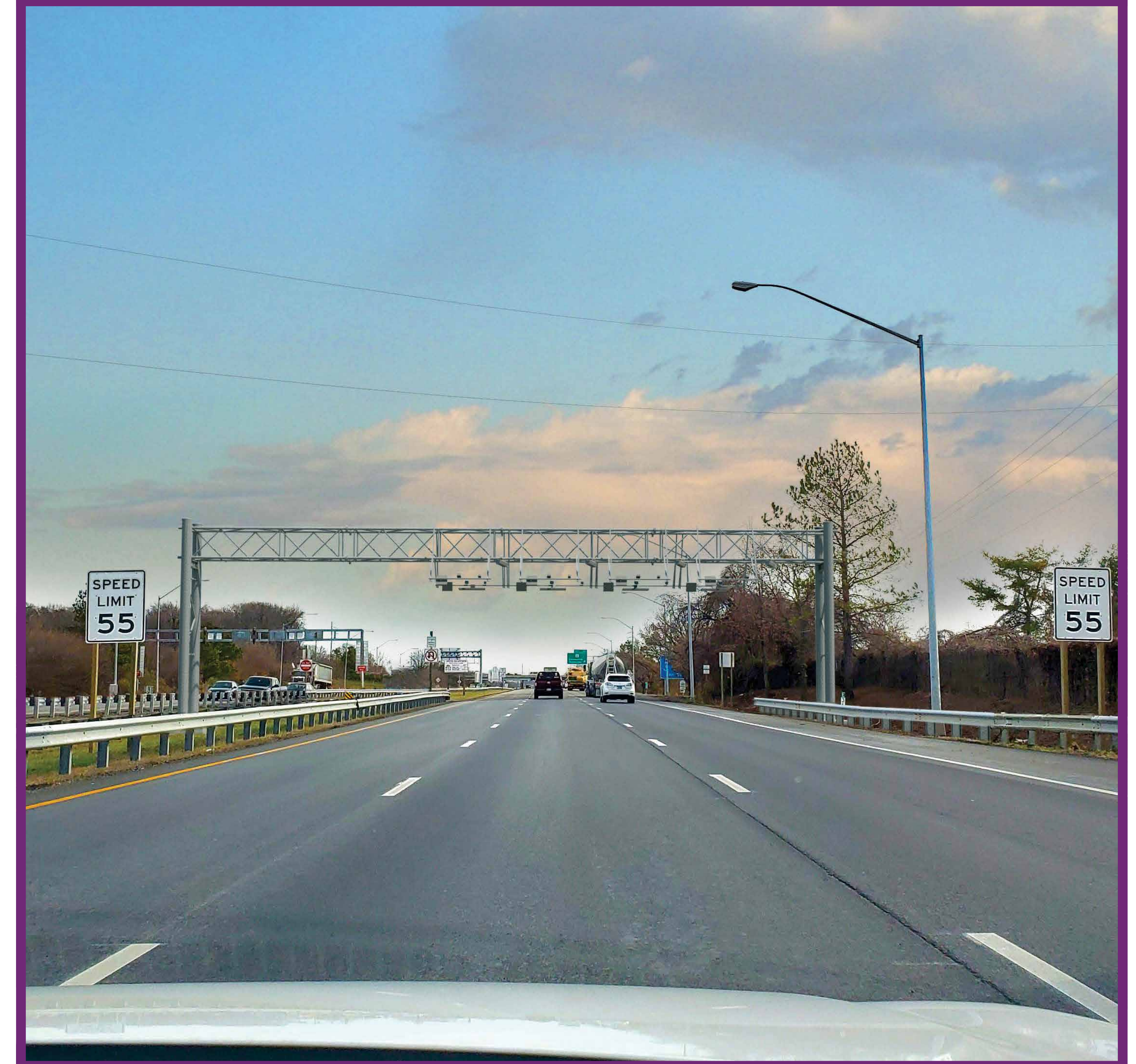
Bay Bridge AET Gantry